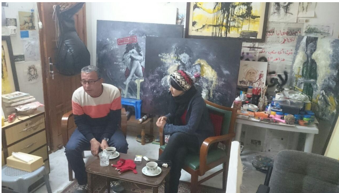
Friday lunch talk via Skype, January 2017

I started communicating with Claudia in order to achieve that project. I needed the energy that the project might give me